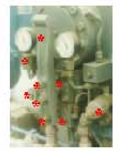
*Lubrication or adjustment points.

Heavily corroded or misadjusted poppet controls will not provide reliable operation and can cause expulsion of oil from the gas/hydraulic tanks on the Rotary Vane. The standard poppet block improvements are :