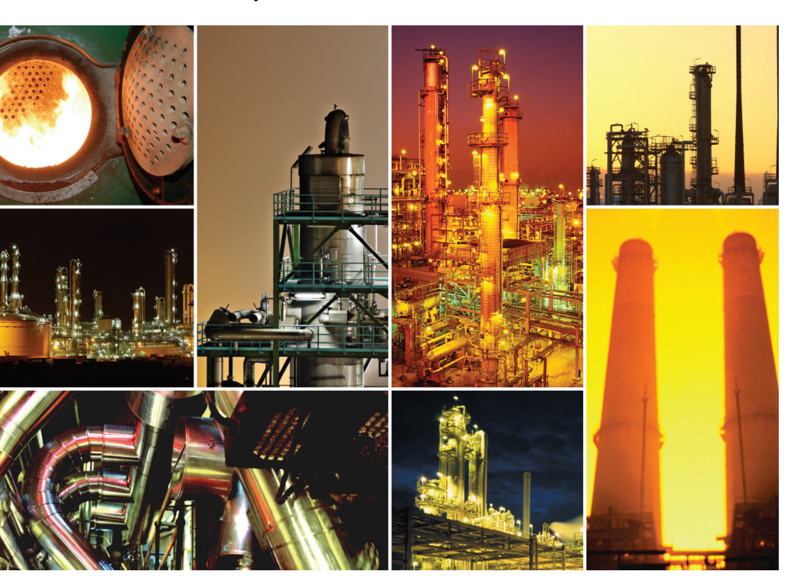
Visualize > Analyze > Optimize

Rosemount Analytical: The Smart Choice for CEMS