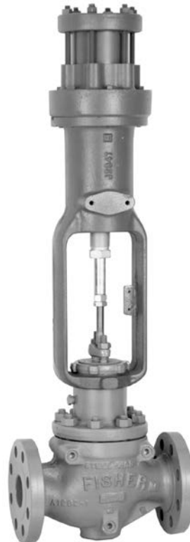
Figure 1. Fisher 1B Actuator on Direct-Acting easy-e™ Valve